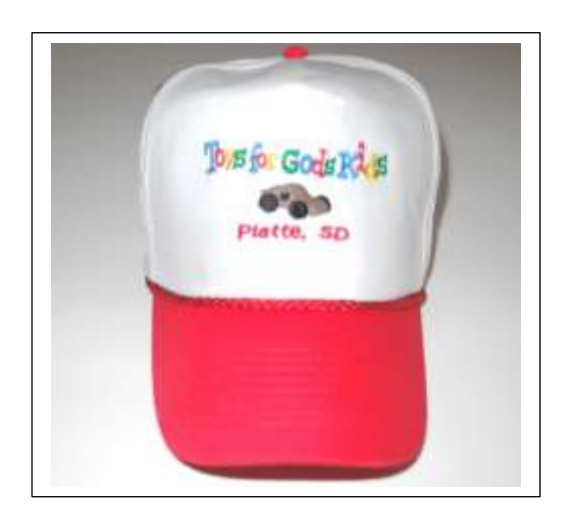
Nice Hat!