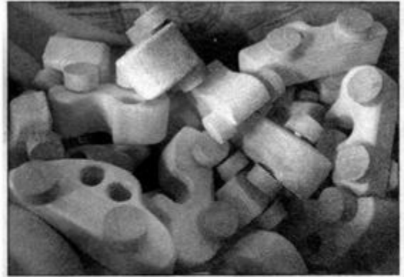
Fresh from the volunteers' assembly line, wooden cars pile up. Toys for God's Kids is asking for $20 donations, to send boxes of cars to soldiers in Iraq, who will hand them out.

Online: Information about the Toys for God's Kids program. denverpost.com